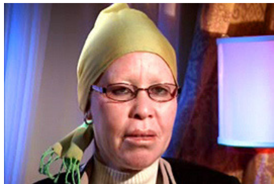
Kwegyir is the first Albino member of parliament in Tanzania

Tanzania's political stability coupled with its stunning landscape including Mount Kilimanjaro have meant the country increasingly attracts large numbers of tourists.