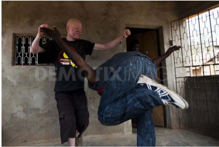
Dancing during a party in the rustic bar.

Albinos in Africa are in full view within the black population of Mozambique. Parents regularly abandon them, leaving albinos to survive on the streets alone. Tete, Mozambique. 16/09/2010